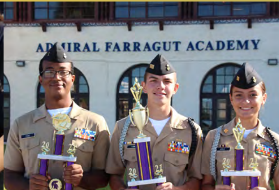
LEADERSHIP & NJROTC