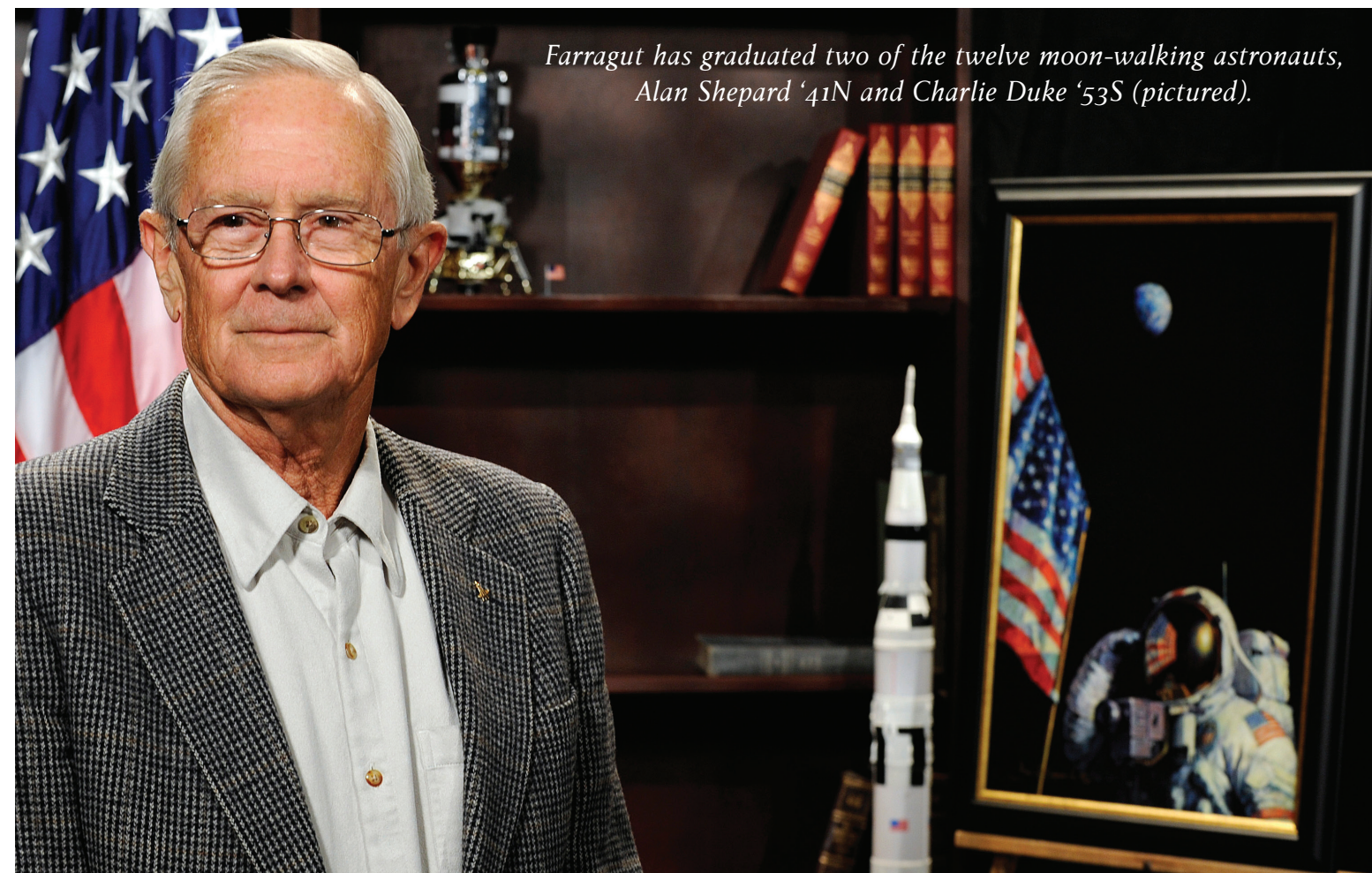
Farragut has graduated two of the twelve moon-walking astronauts, Alan Shepard '41N and Charlie Duke '53S (pictured).