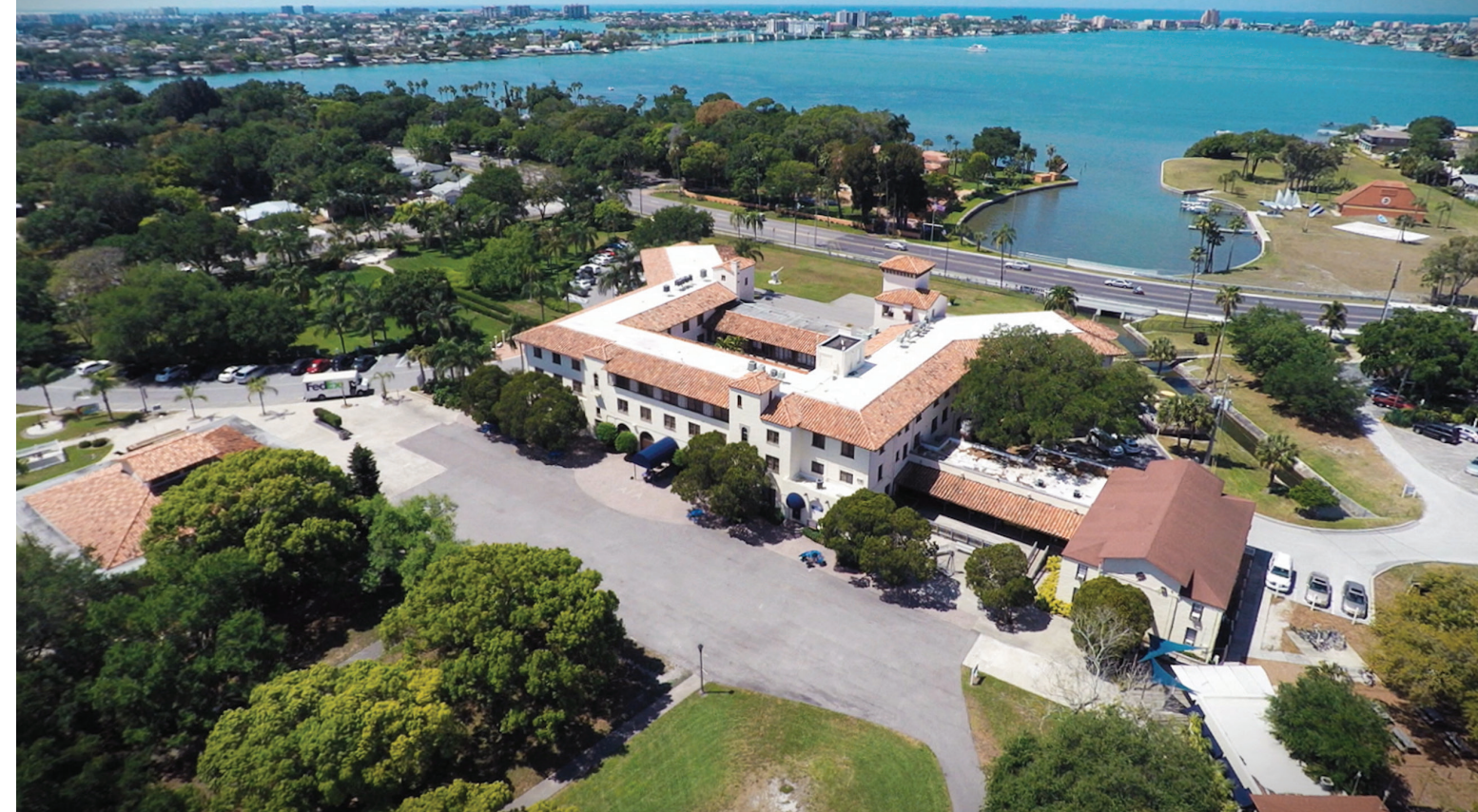
Aerial view of Farragut's waterfront campus. The building shown is known as Farragut Hall and was built in 1925 and remains a historical landmark.

Scientia Omnia Vincit "Knowledge Conquers All"